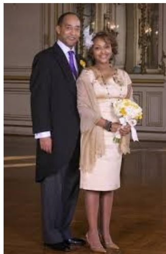
H.I.H. Prince Ermias, and wife, Lady Saba Kebede

Under the leadership of H.I.H. Prince Ermias, the Crown Council of Ethiopia has pursued a mission devoted to cultural and humanitarian efforts.