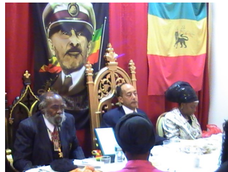
Abuna Foxe, H.I.H. Prince Ermias, Sis. Sonia Foxe

by Prince Ermias Sahle-Selassie Haile-Selassie President of the Crown Council of Ethiopia